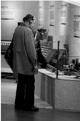
Fig. 2: Exhibition “Magical Soundmachines”

1900 was also about the time when “by serendipity” physicists came up with the first electroacoustic sound generators. An incredible plethora of experiments produced a wide array of electric instruments, and in 1932, for example, an orchestra of the future with electric cello, trautonium, electric violin and theremin performed at the Berlin Radio Exhibition.