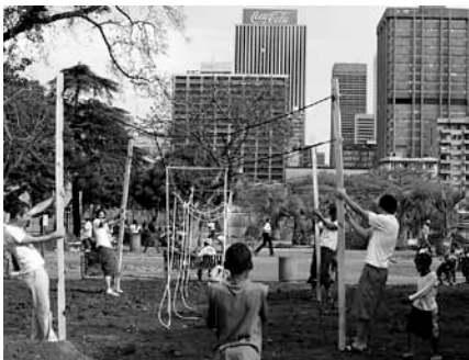
Fig. 4: performance 2 (passage) – a Sentimental Construction, 2007

Here I 'per-form' the landscape to challenge notions of a 'pre-formed' world, or sense, or meaning. By engaging with the unfinished and in-process within my work, I seek to challenge the nature of what is 'given.'