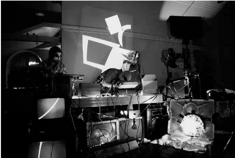
Fig. 2: Koelse live at ihme-club, Vanha, Helsinki 2009

The problem of digital culture is the shortening product cycle. Moores law states that the number of transistors that can be placed inexpensively on an integrated circuit doubles every two years. This enables the exponential growth of computing power, but also leads to the exponential amount of electronic waste.