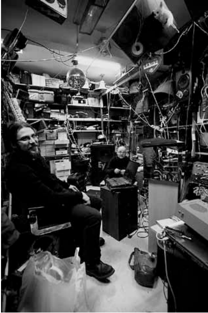
Fig. 3: Koelse studio

is the legacy we leave for future generations. The least we can do is to give some kind of instructions on what you can do with it.